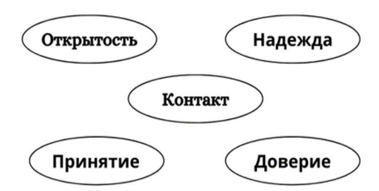
Fig 2. The main relevant abilities developed in inpatient group psychotherapy and psychological support groups: