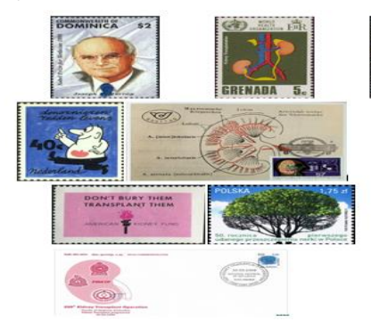
Fig 8: Postage stamp dedicated to Dr. J. Murray and kidney transplantation

Figure 7, shows a Dominica postage stamp (1990) dedicated to Joseph Murray, one of the pioneers of world transplantation. Thanks to the pioneering work of Dr. Joseph Murray (1919-2012) in the 1950s and 1960s, kidney transplants are now performed daily around the world. Dr. J. Murray was the first surgeon to successfully perform a kidney transplant. For his work on organ transplantation in the treatment of human diseases Dr. J. Murray was awarded the Nobel Prize in Physiology or Medicine in 1990 [15].