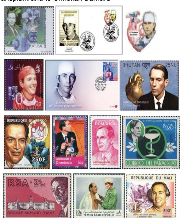
Fig 4: Philatelic materials dedicated to the world's first heart transplant and to Christian Barnard

Next, Fig. 4, presents a large selection of various philatelic materials, dedicated to the memory of the great South African transplant surgeon Christian Netling Barnard (1922-2001) and his December 3, 1967, the world's first successful heart transplant [1]. It is an interesting fact that after his meeting with V.P. Demikhov in Moscow, Christian Barnard called him the true father of transplantology" [2].