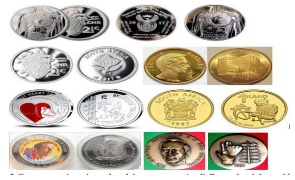
Fig 5: Commemorative coins and medals commemorating C. Barnard and the world's first heart transplant

Continuing the development of the theme of heart transplantation operations and the issue of donation of this organ, Fig. 6, presents a selection of philatelic and numismatic materials from different countries of the world and years of issue, devoted to this important problem [14, 17, 23, 24].