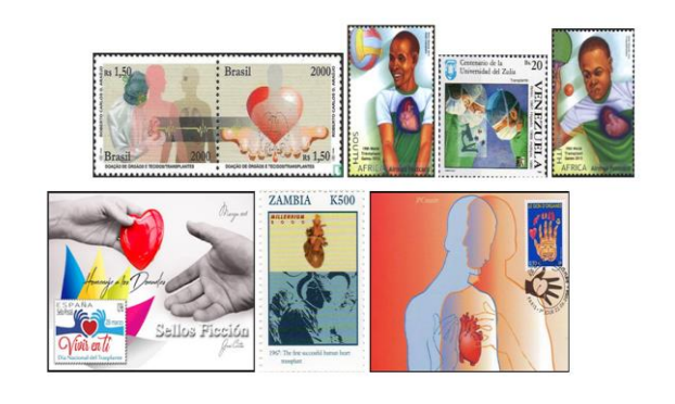
Fig 6. A collection dedicated to heart transplantation

Next, in Fig. 7, presents a small selection of philatelic materials (postage stamps and first-day envelopes, commemorative coins) devoted to transplantology, donation of human organs, transplantation of various human organs and about patients with these transplanted organs [15, 19, 23].