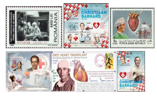
Fig. 5, presents a selection of numismatic materials (commemorative coins and medals) devoted to Christian Barnard and the first human heart transplant operation [1, 3, 18].